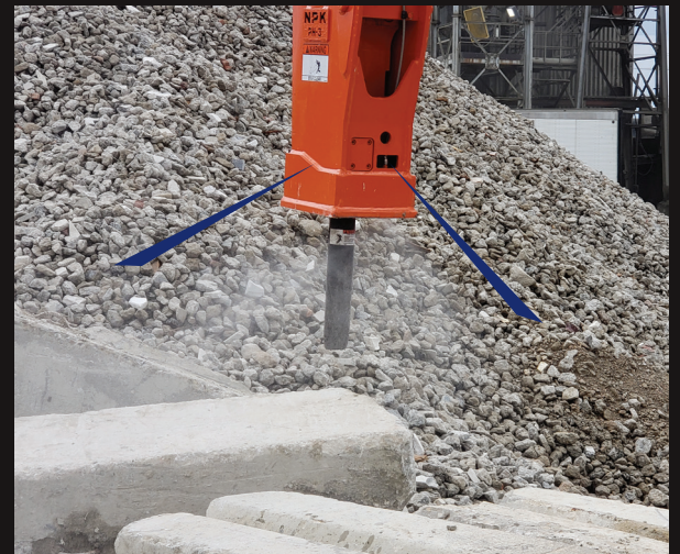
Wide spray angle for maximum coverage

(*NOTE: Water reservoir and pump not included.)