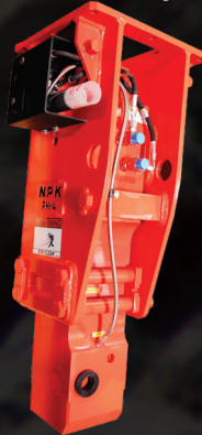
G050: Compatible with GH-23, GH-30, GH-40, GH-50 Max Output/Hour at 24V: 0.85 lbs (0.38 kg)